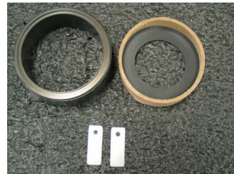
RK935 Rebuild kit Fig B