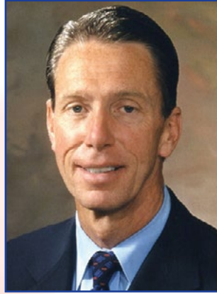
STEPHEN F. LYNCH

Congressman Stephen F. Lynch was sworn in to the United States Congress in October 2001, following the passing of legendary Congressman John Joseph Moakley.