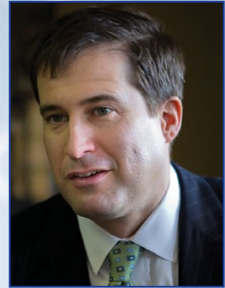
SETH W. MOULTON

Seth Moulton is a progressive Democrat and Iraq War veteran fighting to bring real change to Washington. Seth believes we need a new generation of leaders to fix Congress and actually get things done: raise the minimum wage, achieve pay equity for women, strengthen gun control, protect Social Security and Medicare, and invest in job training.