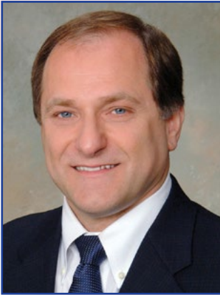
MICHAEL E. CAPUANO

Congressman Capuano is currently serving his eighth term as a Member of Congress. Prior to his election in 1998, Capuano was Mayor of Somerville for five terms. He was elected Mayor in 1990, and in 1998, he served as President of the Massachusetts Municipal Association, a statewide organization that represents the interests of the Commonwealth's 351 communities. He is also past President of the Massachusetts Mayors' Association.