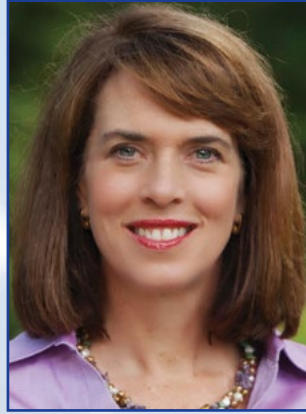
KATHERINE M. CLARK

On December 10, 2013, Congresswoman Clark was sent to Washington by the people of Massachusetts's 5th Congressional District to be their voice as Congress debates the most critical issues of our time.