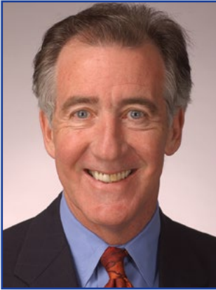
RICHARD E. NEAL

Congressman Richard Neal is running for re-election to the United States House of Representatives in the newly formed 1st Congressional District of Massachusetts. Following in the footsteps of Western Massachusetts' dedicated and celebrated representatives in Washington, D.C., he has distinguished himself with his tireless work ethic and commitment to constituent service.