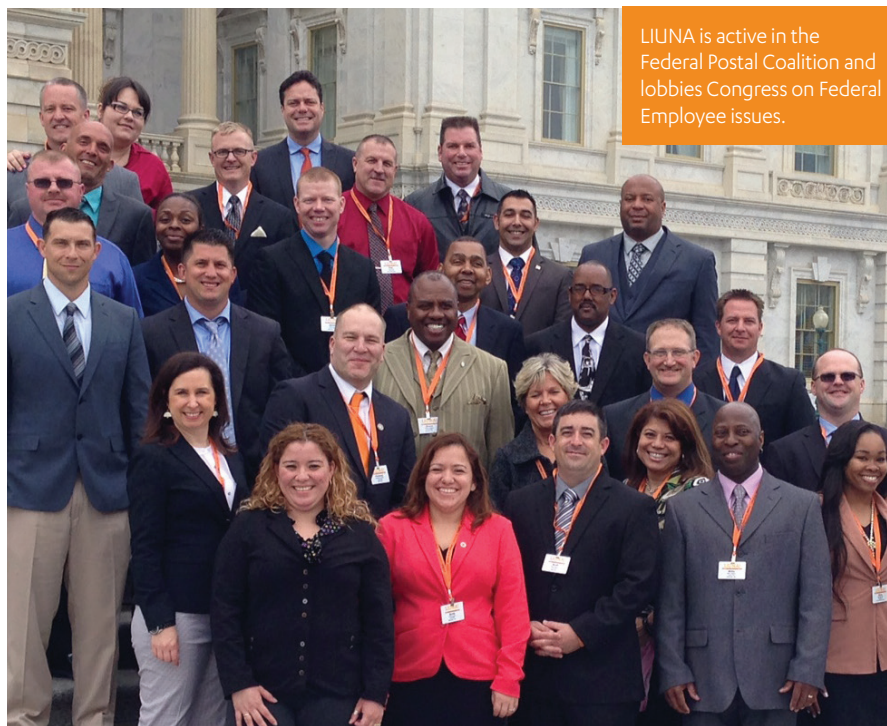
LIUNA is active in the Federal Postal Coalition and lobbies Congress on Federal Employee issues.