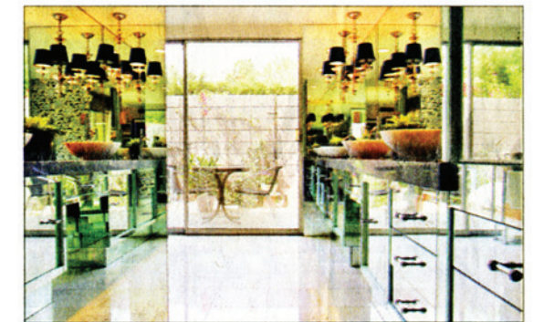
THE GLOW: The Mininnis kept the previous owner's mirrored cabinetry in the master bath to retain that Old Hollywood glamour. In the master bedroom, below, the headboard is upholstered; Murano glass table lamps sit on ebony bachelors chests; and an upholstered bench in gray silk is at the end of the bed.