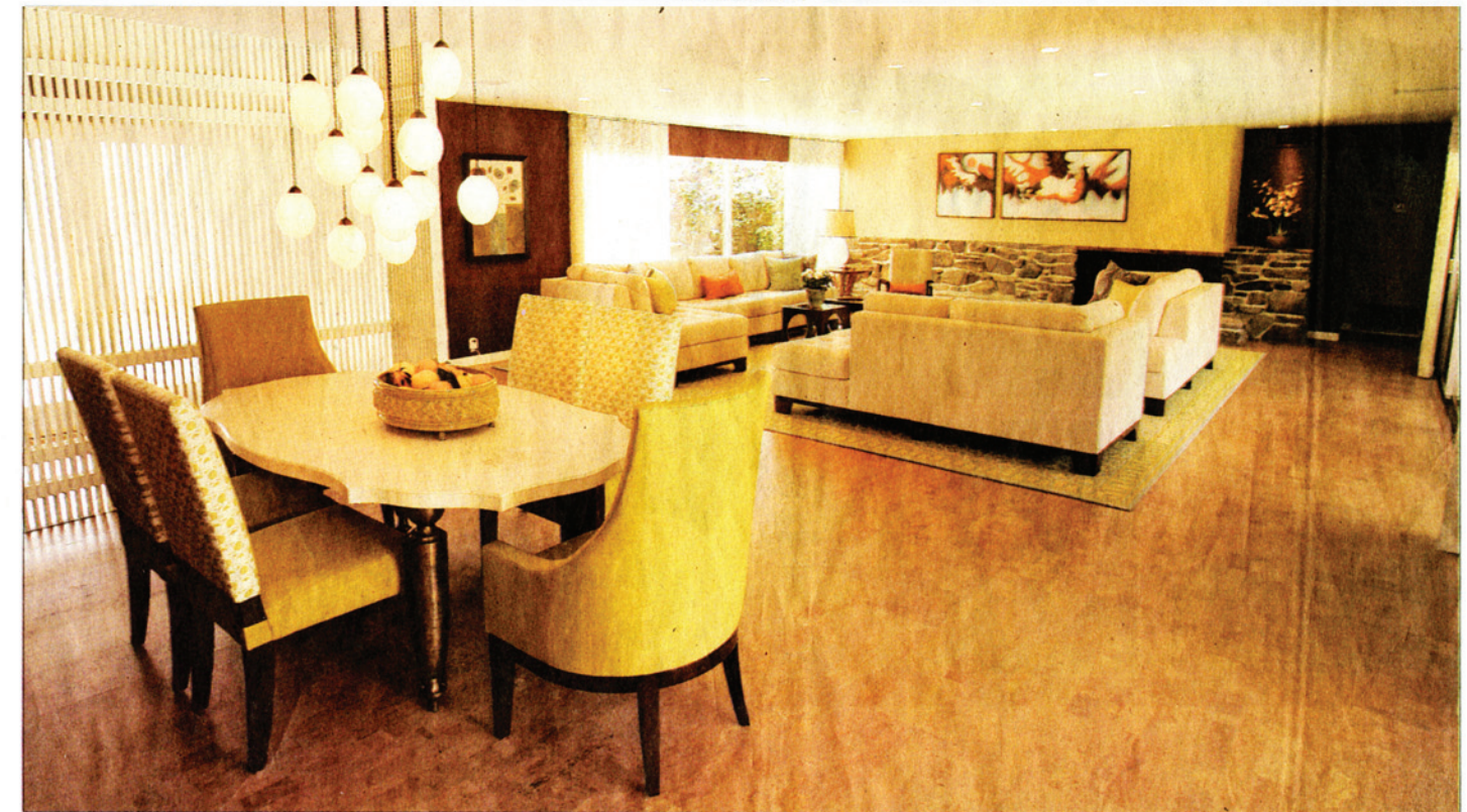
NEW AND OLD: The new dining table sits on brass legs; the new light fixture is made of hand-blown glass globes. The living room's lava-rock fireplace is original.